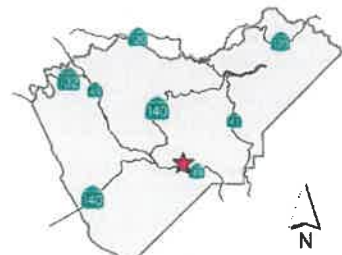
Location in Mariposa County

Mariposa County Planning Department PO BOX 2039 5100 Bullion Street Mariposa, California 95338-2039 209.966.5151 FAX 209.742.5024 mariposaplanning@mariposacounty.org http://www.mariposacounty.org/planning