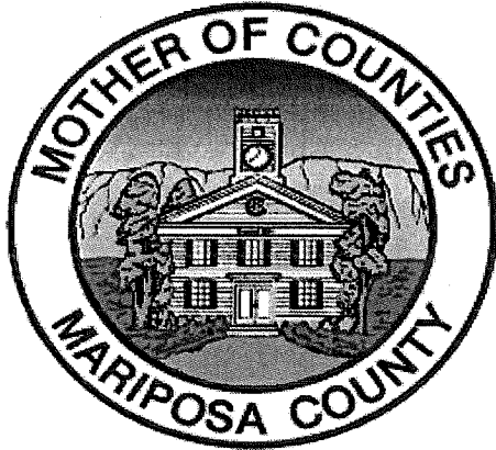
EXHIBIT "A" COUNTY OF MARIPOSA DISCIPLINE POLICY