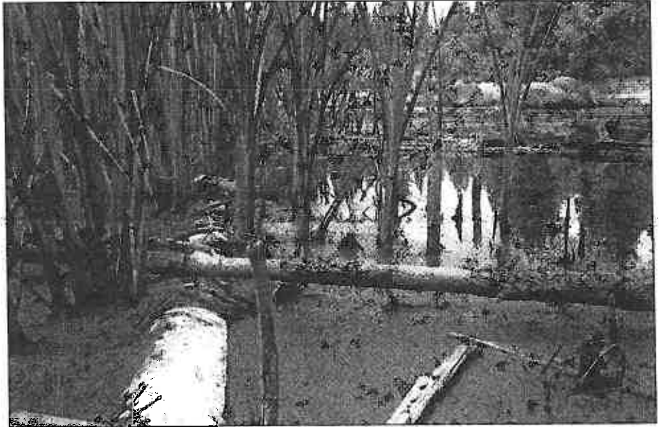
ERIK SKINDRUD | THE GAZETTE

A plastic water line that connects Lushmeadows' Mallard Lake to a fire hydrant sat exposed on the lake's bottom last week. If the water level drops another foot or two, firefighters will no longer have access to water via this connection.