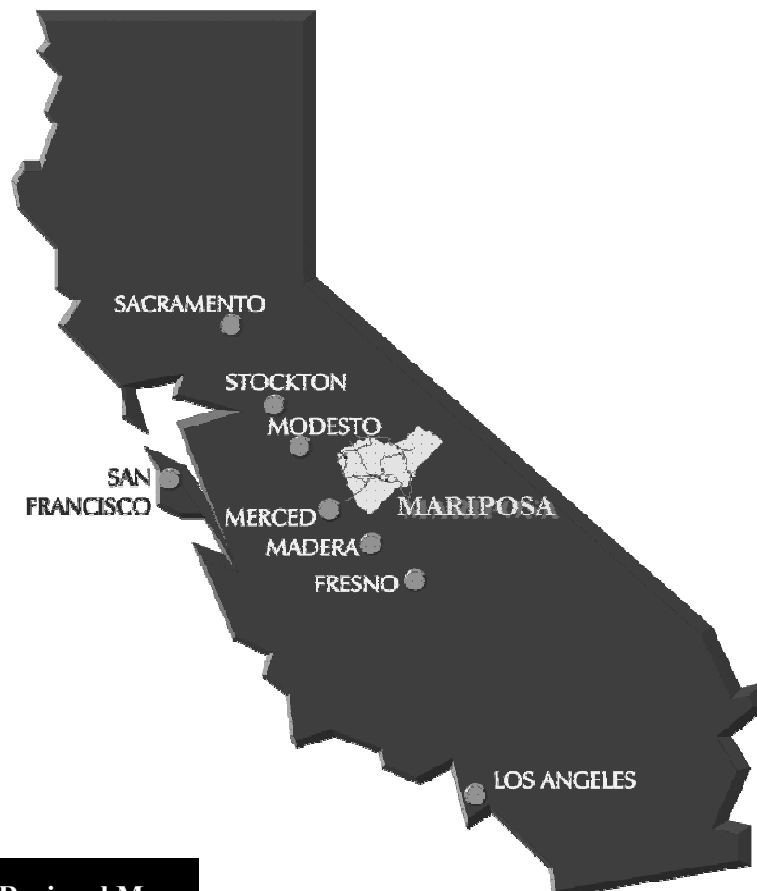
Figure 1-1: Regional Map

T he County of Mariposa is located in central California, adjacent to the San Joaquin Valley within the central Sierra Nevada. Mariposa County is surrounded by Tuolumne County on the north and east, Madera County on the south, and Merced and Stanislaus counties on the west (Figure 1-1). Mariposa County boundaries are approximately 25 minutes from Merced and one hour from the cities of Modesto, Madera, Sonora, and Fresno. The Town of Mariposa is a little less than two hours from Fresno-Yosemite International Airport, three and one half hours from Oakland International Airport, four hours from Sacramento International Airport, and over four hours from San Francisco International Airport. Merced’s Amtrak train station is an inter-modal transfer point with the Yosemite Area Regional Transit System.