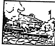
MARIPOSA HISTORICAL CENTER