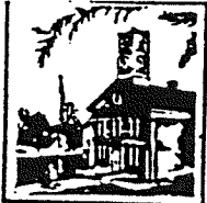
MARIPOSA COURTHOUSE Since 1864